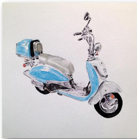
Ilana Crispi, Scooter , Watercolor on Paper

You can view pictures of the exhibit in the Faculty 2012 show Photo Album at the Gallery's Facebook page: http://www.facebook.com/skygallery