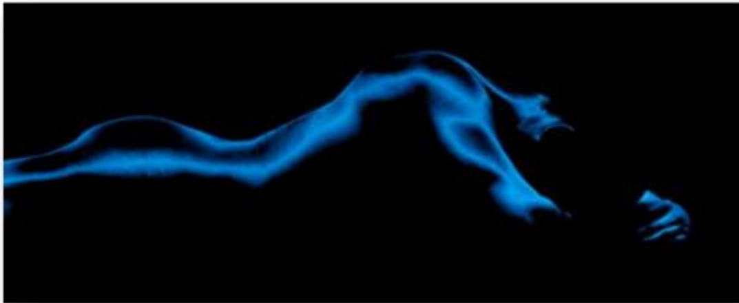
Arthur Takayama, Electric Blue , Photograph