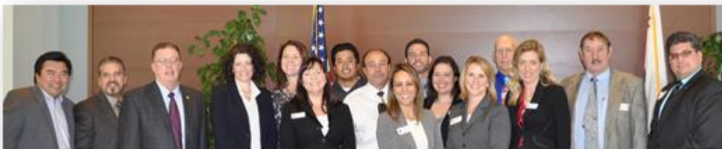
The 2013 San Bruno Chamber of Commerce Board of Directors.