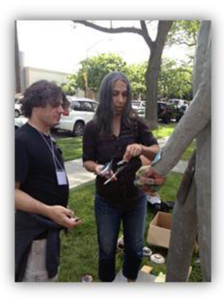
sculpture will be permanently installed in downtown Davis.

Ceramic hand created by the Skyline College Ceramics Club for the community sculpture at the conference.