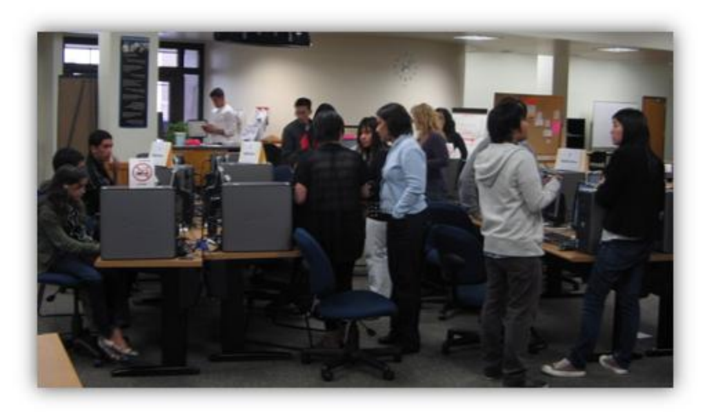
This past "Super Saturday" ESL Registration Day event helped more than thirty new ESL students apply and register for ESL classes at Skyline College.

The ELI wishes to thank the SparkPoint at Skyline College for its generous support in making Skyline College ESL Registration Day possible, as well as our many staff and student helpers. Any new student of ESL who wishes to take part in Skyline College ESL Registration Day is advised to arrive promptly at 9:00 a.m. this Saturday at the Learning Center. For more information, call (650) 738-7089 or email <a href="mailto:skyeli@smccd.edu">skyeli@smccd.edu</a>.