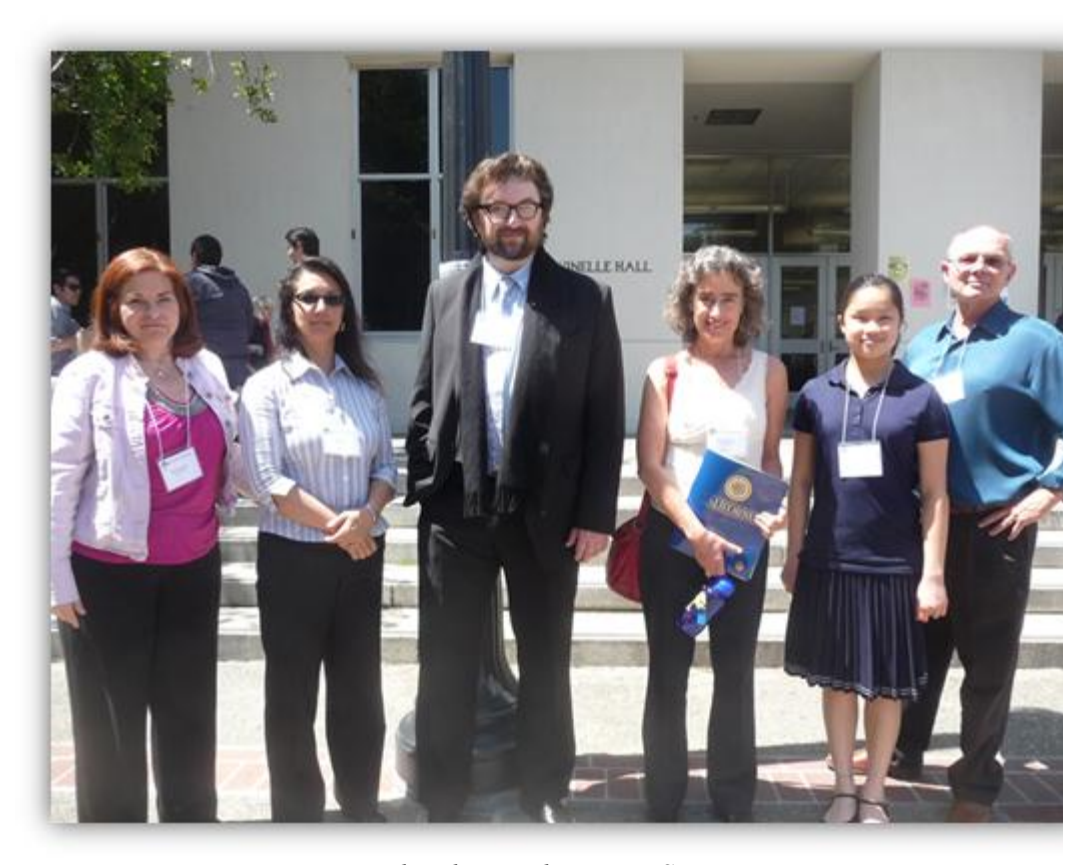
Mentors and students at the Honors Symposium