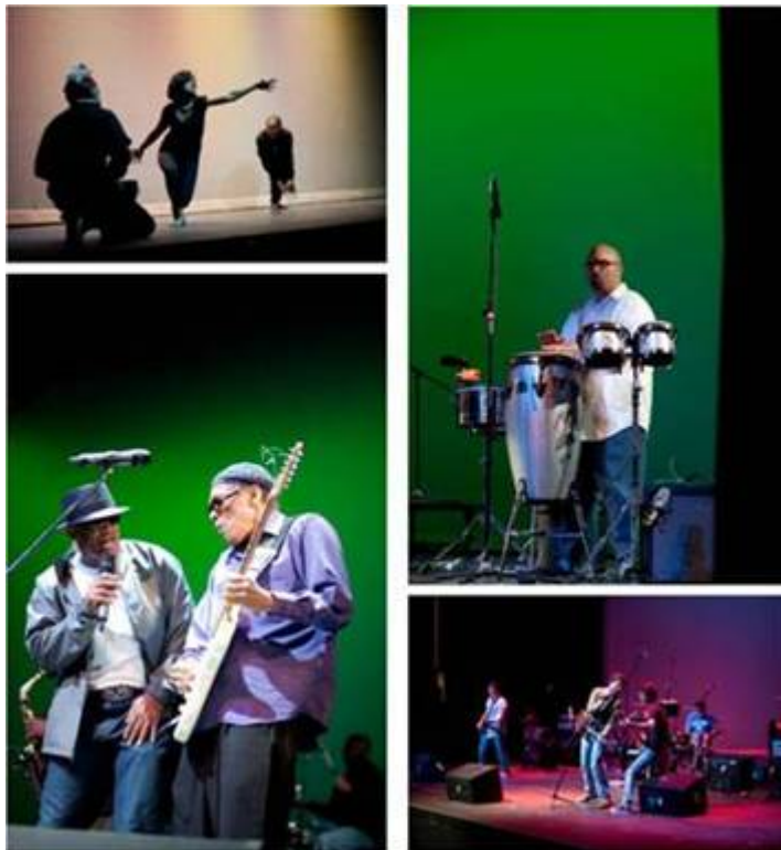
Haiti Now Task Benefit Concert a

Skyline College invites the community to join us for part of our 40 th Anniversary celebration on Thursday, May 6 when a number of things will be going on that are worth celebrating. We will hold our ribbon cutting for the new Automotive Technology Building 11, unveil two new art projects, see the student art exhibit in the Gallery, experience Dance and Athletics performances in the Gym, and enjoy a food tasting in the Main Quad. Thanks to our President's Council for their leadership in making this all come together!