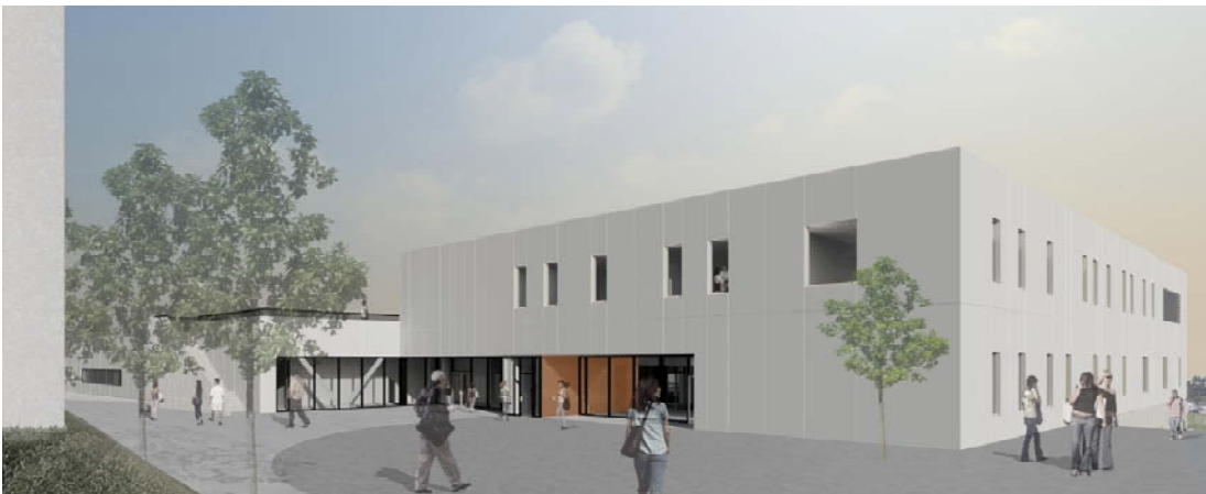
View looking from Building 2, looking toward the northeast. Graphic by WRNS Architects