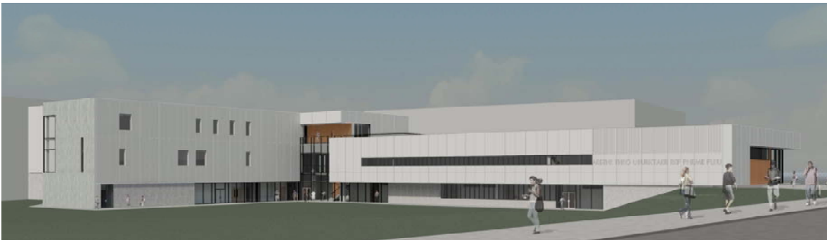
View looking from the loop road, looking southwest. Graphic by WRNS Architects

We are firming up the details on the new Multicultural, Cosmetology, Classroom and Administration building, Building 4N. Here is a depiction of the building from a couple of points of view. It will sit to the east of the Library and to the north of the Gym.