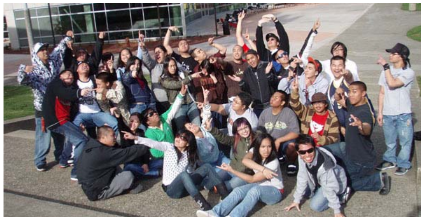
Students in the Kababayan program performed "Parting Ways" at the Third Annual PCN