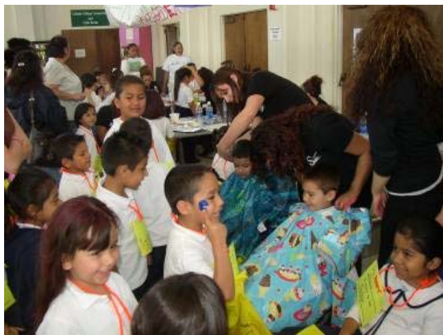
Students receive the royal treatment from Cosmetology Students at Kinder Cañada.

On April 27, Cañada College hosted Kinder Cañada where 1,200 5-year-olds visited the college to open their eyes to the future. Twenty-seven Skyline College Cosmetology students and three instructors painted faces, and gave wacky hairdos and wrist tattoos to at least 600 children. They even 'wacky-haired' four staff members and a Cañada dean. The Cosmetology instructors and students had a wonderful time and it is certain that the five-year-olds did too.