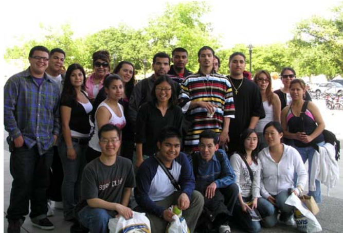
Puente and MESA students at UC Davis