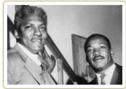
Bayard Rustin pictured with Dr. Martin Luther King, Jr.