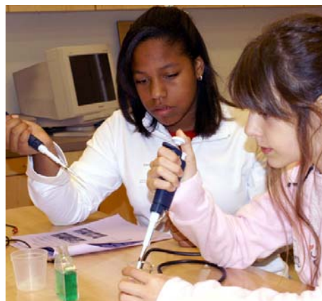
Biology workshops were one of several programs available to EYH students.

Expanding Your Horizons in Math and Science (EYH): Skyline College presented the 26 th annual Expanding Your Horizons in Math and Science, a conference for 6 th through 12 th grade young women, on Saturday, March 18. More than 800 girls participated this year. The conference teaches girls about career opportunities in math and science. Each girl attended workshops during the all-day conference, as well as met women who use science and math in their careers as well as women in non-traditional careers. Workshops were held in biotechnology, medicine and allied health, life sciences, physical sciences and computer science, and concurrent programs are available for parents.