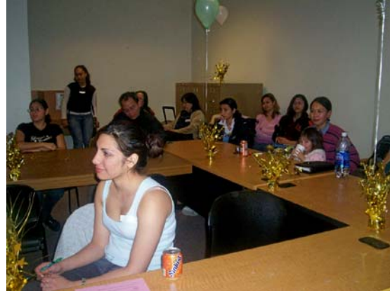
New TRIO students received information on Skyline's support services, transfer, graduation, and scholarships at the February orientation.