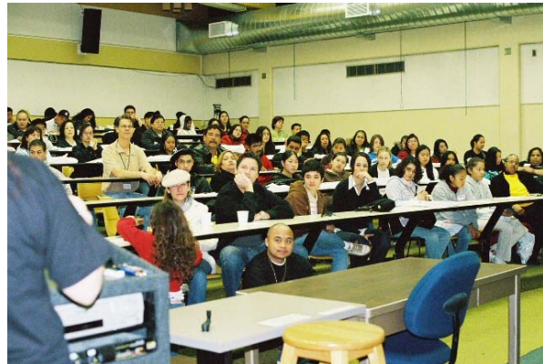
Making the Connection provided information on academic and career resources for high school students who are considering college.