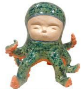
2009 SKYLINE JURIED STUDENT ART EXHIBIT GALLERY THEATRE APRIL 28 - MAY 14 RECEPTION: APRIL 28, 5:30-7:30 PM